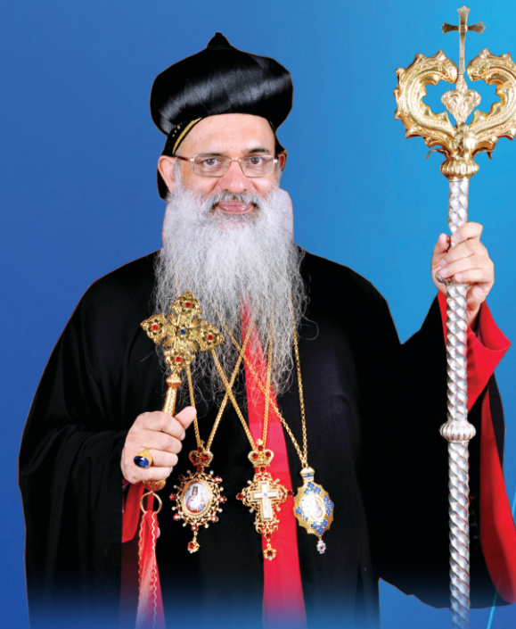
H.H. BASELIOS MARTHOMA PAULOSE II Catholicos of the East and Malankara Metropolitan