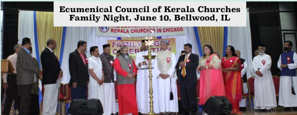
Ecumenical Council of Kerala Churches Family Night, June 10, Bellwood, IL

Where, to what and how we are connected is the most precise reflection of the state of our world. If we dare to bring light, hope and true beauty back to this broken world, we need to check whether we connected to Christ the true vine by whom we bear much fruit (Cf. St. John 15:5).