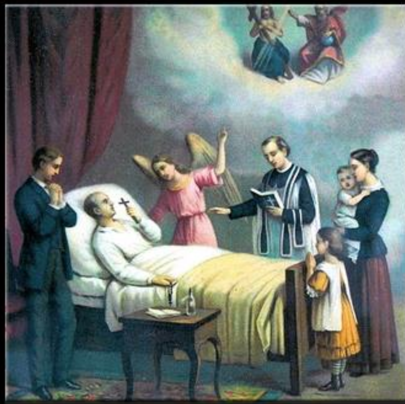
The Death of the Righteous