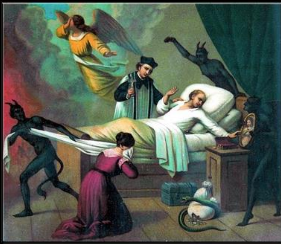
The Death of the Unrepentant Sinner